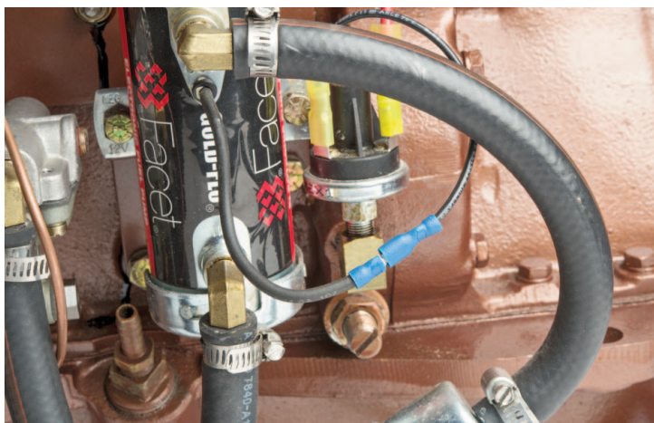
Included quick disconnect terminal preinstalled between fuel pump and OPSS.